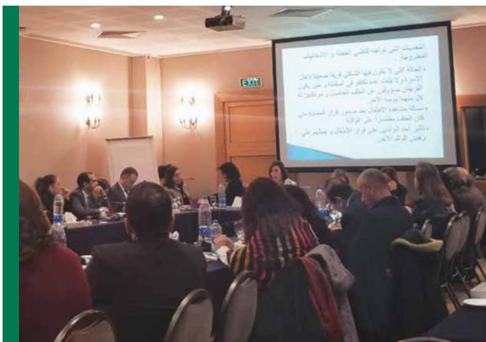
A conference on gender-based violence (GBV) in Beirut.

I try to convey that I'm cognizant of my own country's problems, and I don't think Lebanon is either a hopeless case or incompetent at solving its problems, but that its torture problem is real and pressing. Some Lebanese dispute this. A lot of people