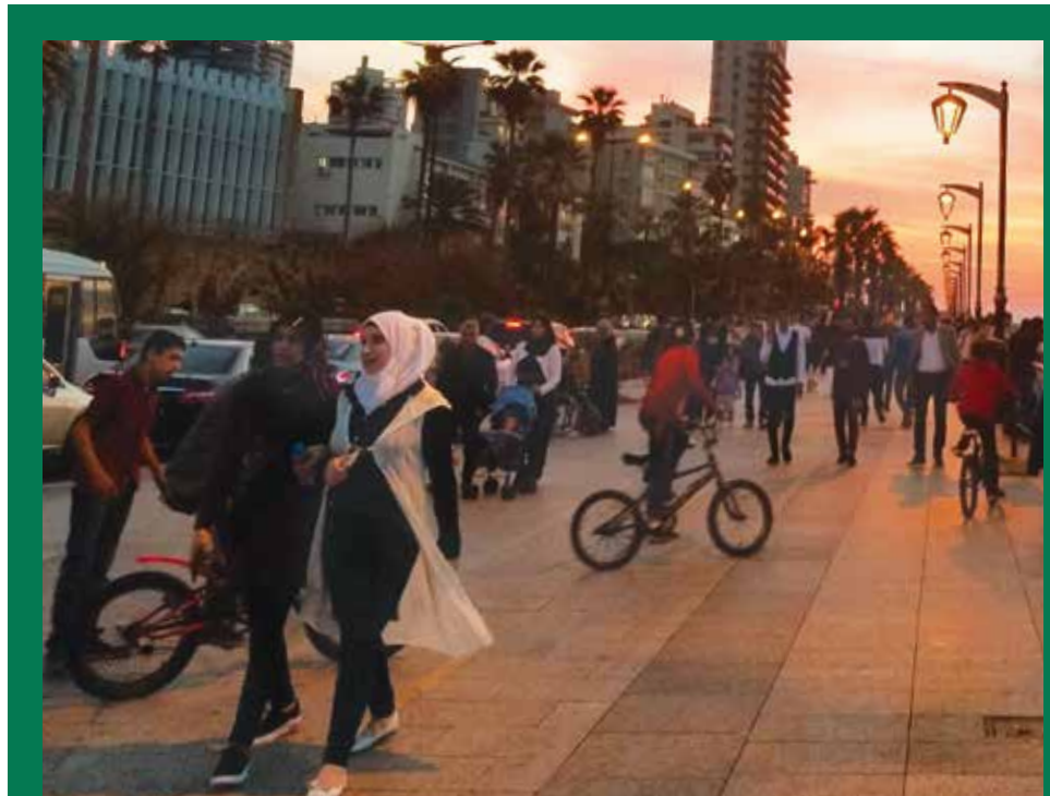
The Corniche Beirut, a bustling walkway along the Mediterranean Sea.

One thing I do know: When the U.S. violates human rights, it damages not only its reputation, but the belief of people