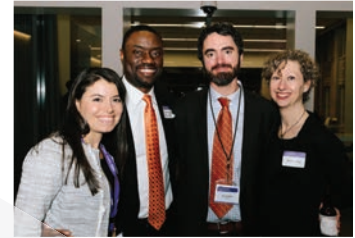
Moments from the CFJC's 25th Anniversary celebration.