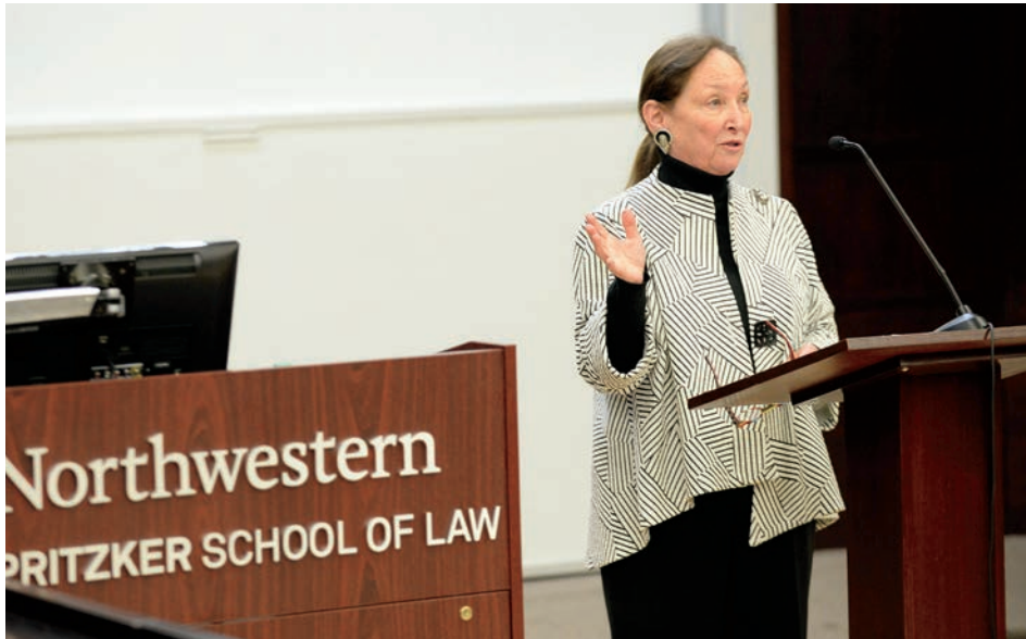
Justice Rosalie Silberman Abella speaks to the Northwestern Law community about protecting the rights of vulnerable groups.